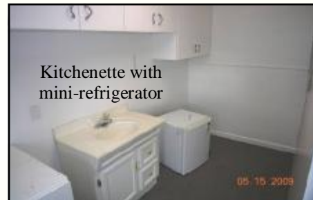
Kitchenette with mini-refrigerator 05-15-2009