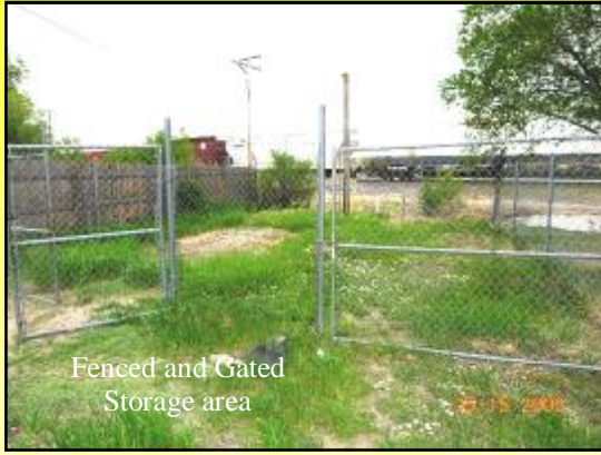
Fenced and Gated Storage area