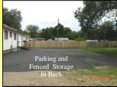
Parking and Fenced Storage In Back