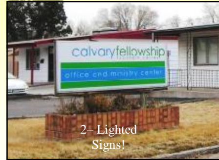
2- Lighted Signs!