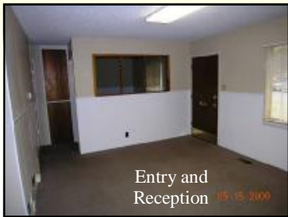
Entry and Reception 05-15-2009