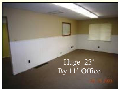
Huge 23' By 11' Office 05-15-2009