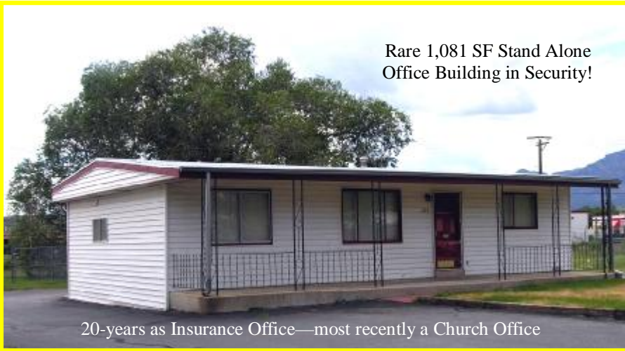
Rare 1,081 SF Stand Alone Office Building in Security!