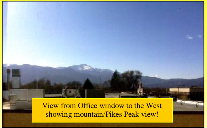
View from Office window to the West showing mountain/Pikes Peak view!