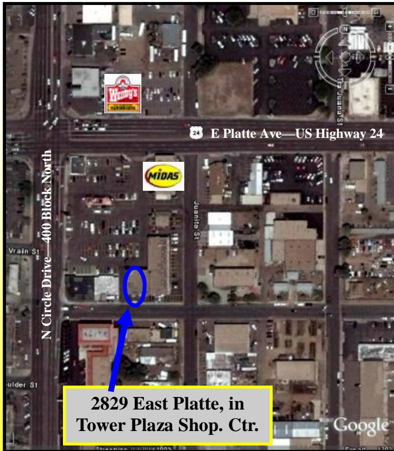
2829 East Platte, in Tower Plaza Shop. Ctr.