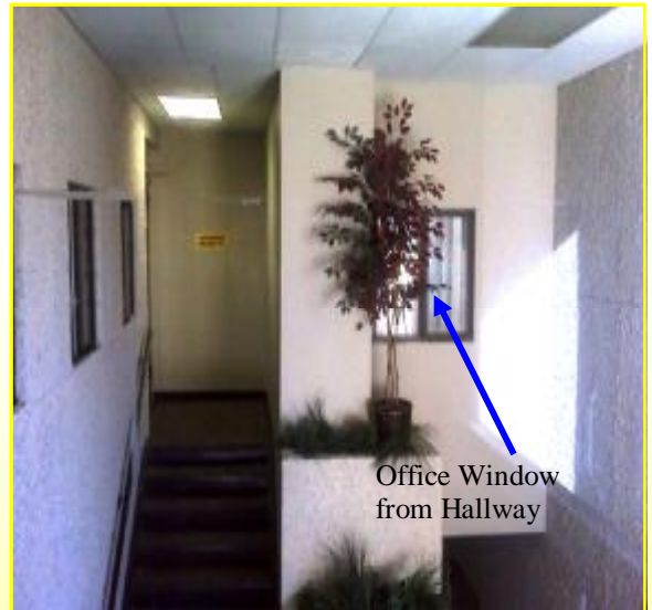
Office Window from Hallway