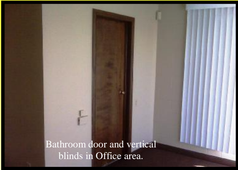
Bathroom door and vertical blinds in Office area.