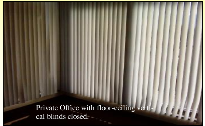
Private Office with floor-ceiling vertical blinds closed.