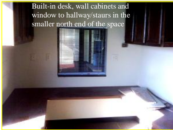
Built-in desk, wall cabinets and window to hallway/stairs in the smaller north end of the space