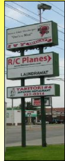
Sign on South Nevada Ave.