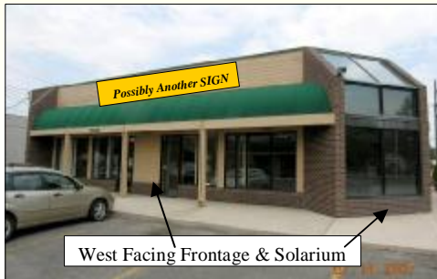
West Facing Frontage & Solarium