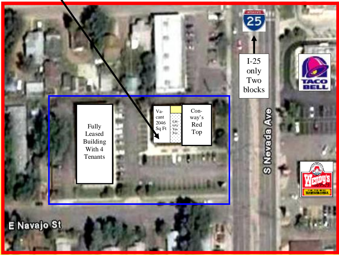
Aerial View of Ivywild Plaza Shopping Center and location of Vacancy