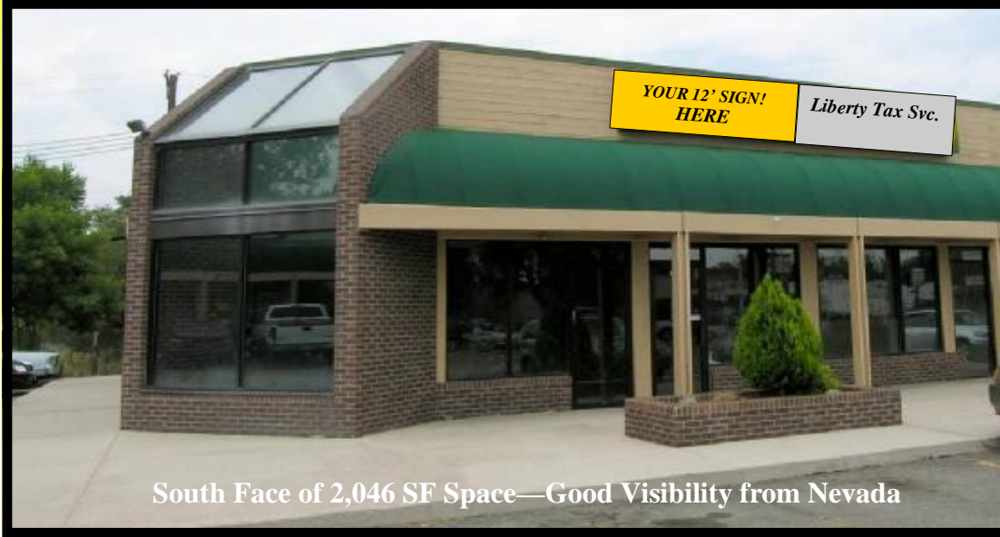
South Face of 2,046 SF Space—Good Visibility from Nevada