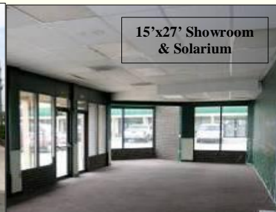
15'x27' Showroom & Solarium